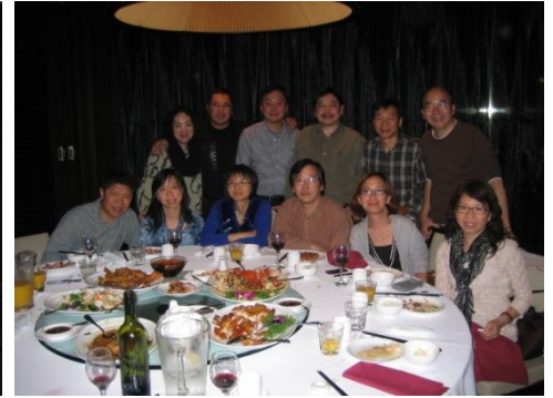
Dinner after camp