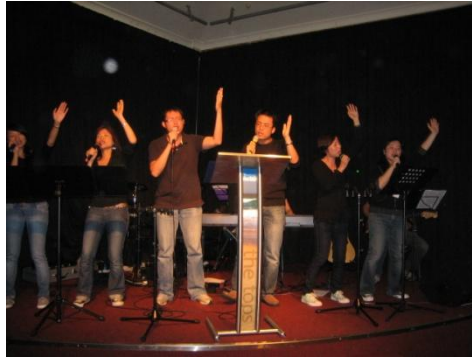
Camp - Worship Time