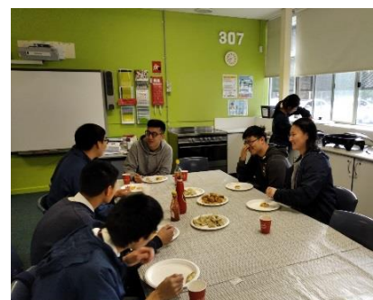
Pennant Hills High School Breakfast Club

The program is held on every 2 nd Friday from 10:30 am to 12:30 pm at the Church Building. The activities include: message, singing, sharing, and tips on daily living etc. All interested parties are welcome to join.