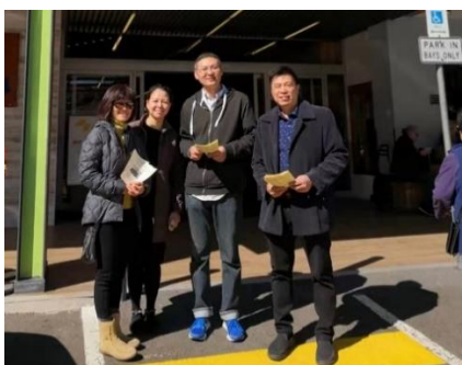
Distributing gospel leaflets