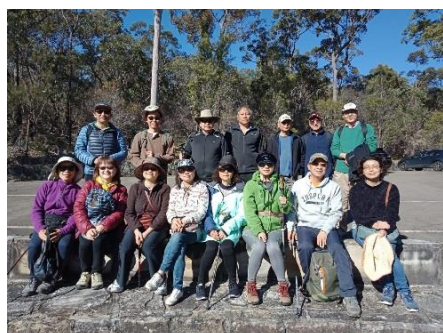
Bush Walking Activity