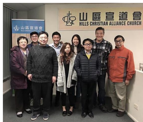
English Advisory Committee