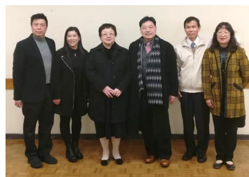
Mandarin Advisory Committee