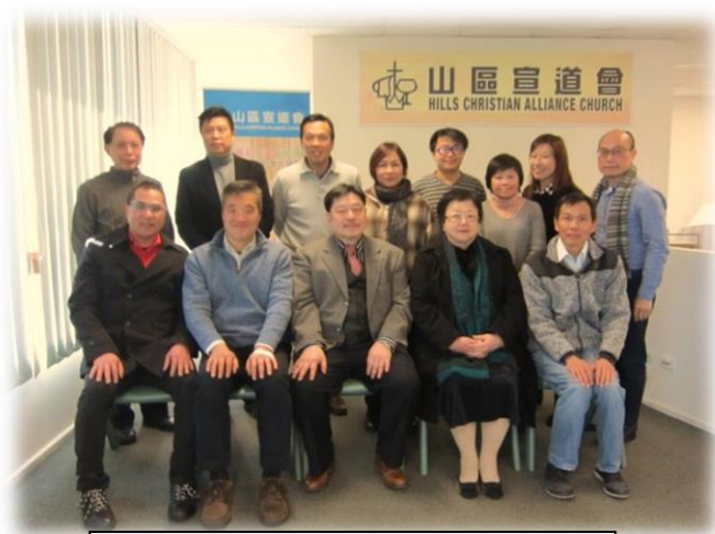
2018-2020 Deacon Board